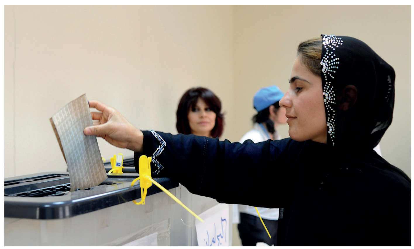
Promoting women's economic empowerment is a prerequisite for women's equal and active participation in political decision-making

society organisations is encouraged, both in Ukraine and in other conflict situations.