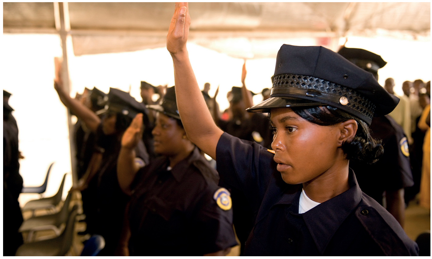
Gender equality leads to more effective military and civilian crisis management operations.

agenda will be integrated into all relevant national and international activities.