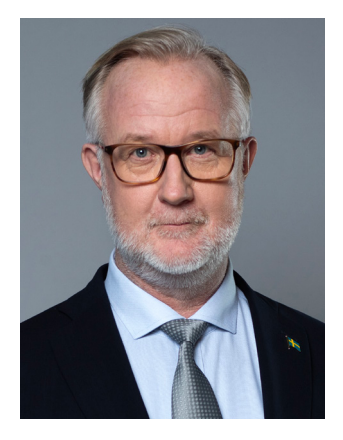
Johan Pehrson (L) Minister for Employment and Integration Ministry of Employment