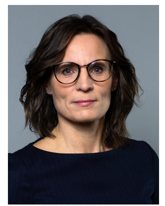
Jessika Roswall (M) Minister for EU Affairs Prime Minister's Office