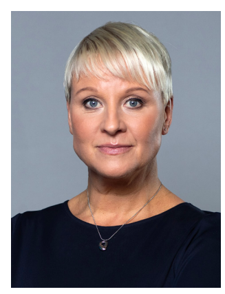
Anna Tenje (M) Minister for the Elderly and Social Security Ministry of Health and Social Affairs