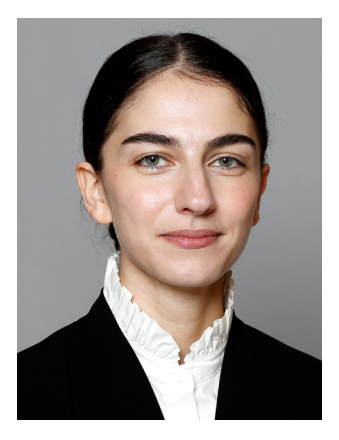
Romina Pourmokhtari (L) Minister for Climate and the Environment Ministry of Climate and Enterprise