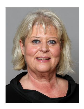
Camilla Waltersson Grönvall (M) Minister for Social Services Ministry of Health and Social Affairs