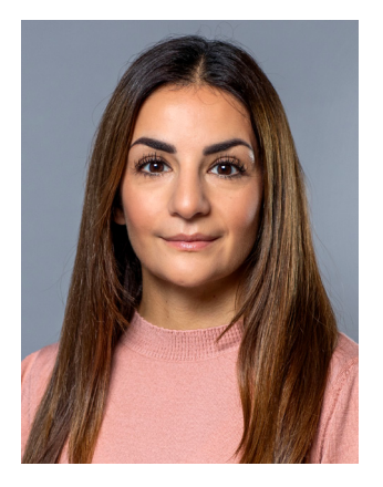
Parisa Liljestrand (M) Minister for Culture Ministry of Culture