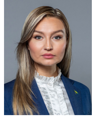
Ebba Busch (KD) Minister for Energy, Business and Industry Ministry of Climate and Enterprise