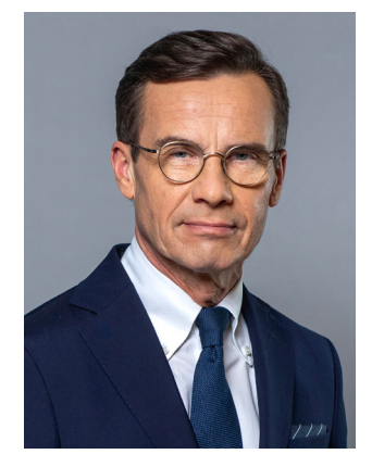
Ulf Kristersson (M) Prime Minister Prime Minister's Office