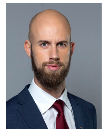
Carl-Oskar Bohlin (M) Minister for Civil Defence Ministry of Defence