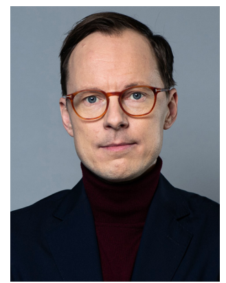
Mats Persson (L) Minister for Education Ministry of Education and Research