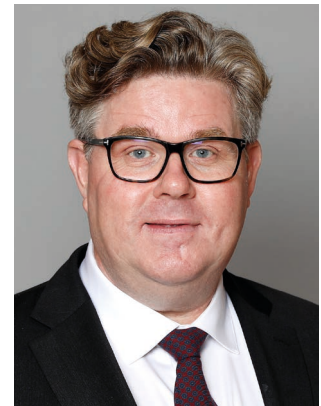
Gunnar Strömmer (M) Minister for Justice Ministry of Justice