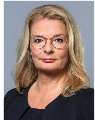
Lotta Edholm (L) Minister for Schools Ministry of Education and Research