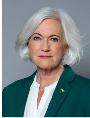
Acko Ankarberg Johansson (KD) Minister for Health Care Ministry of Health and Social Affairs