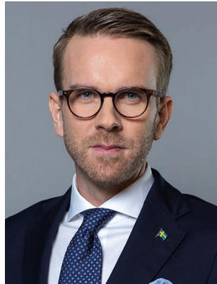
Andreas Carlson (KD) Minister for Infrastructure and Housing Ministry of Rural Affairs and Infrastructure