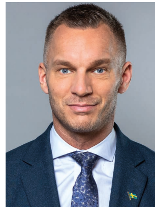
Erik Slottnér (KD) Minister for Public Administration Ministry of Finance