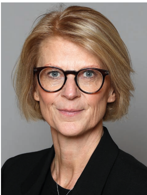
Elisabeth Svantesson (M) Minister for Finance Ministry of Finance