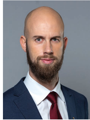
Carl-Oskar Bohlin (M) Minister for Civil Defence Ministry of Defence