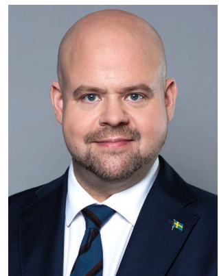
Peter Kullgren (KD) Minister for Rural Affairs Ministry of Rural Affairs and Infrastructure