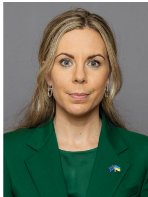
Jessica Rosencrantz (M) Minister for EU Affairs Prime Minister's Office