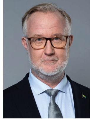
Johan Pehrson (L) Minister for Education Ministry of Education and Research