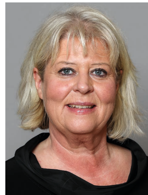
Camilla Waltersson Grönvall (M) Minister for Social Services Ministry of Health and Social Affairs