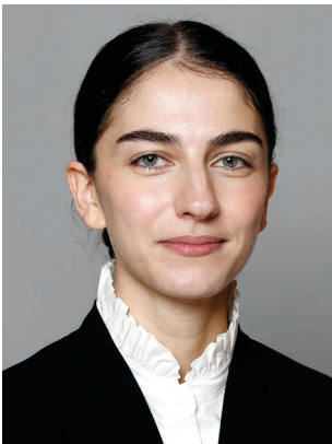
Romina Pourmokhtari (L) Minister for Climate and the Environment Ministry of Climate and Enterprise