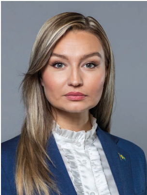
Ebba Busch (KD) Minister for Energy, Business and Industry Ministry of Climate and Enterprise