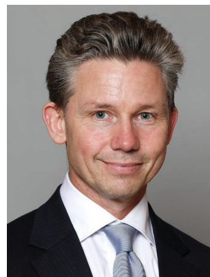
Pål Jonson (M) Minister for Defence Ministry of Defence