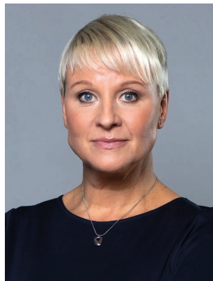
Anna Tenje (M) Minister for the Elderly and Social Security Ministry of Health and Social Affairs