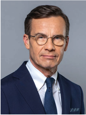
Ulf Kristersson (M) Prime Minister Prime Minister's Office