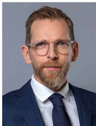
Jakob Forssmed (KD) Minister for Social Affairs Ministry of Health and Social Affairs