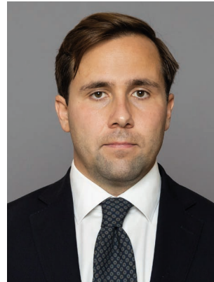
Benjamin Dousa (M) Minister for International Development Cooperation and Foreign Trade Ministry for Foreign Affairs