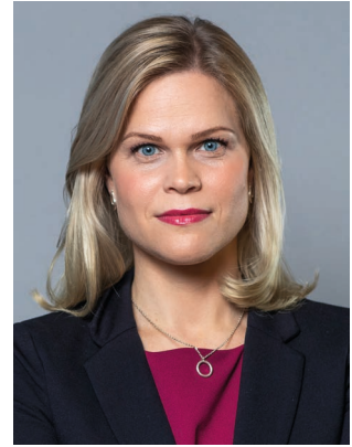
Paulina Brandberg (L) Minister for Gender Equality and Working Life Ministry of Employment