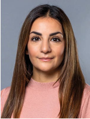
Parisa Liljestrand (M) Minister for Culture Ministry of Culture