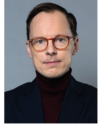
Mats Persson (L) Minister for Employment and Integration Ministry of Employment