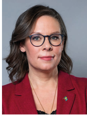
Maria Malmer Stenergard (M) Minister for Foreign Affairs Ministry for Foreign Affairs