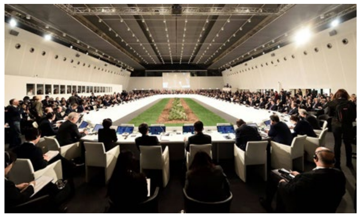
Participants during the opening session of the 25th OSCE Ministerial Council in Milan, 6 December 2018.

The CSBMs also need to be adapted to changing circumstances. As Chair, we will continue to support discussions on the proposal for a modernisation of the Vienna Document with the aim of increasing transparency and predictability, and strengthening confidence between states on military matters. We see the Structured Dialogue as an important platform to contribute to these discussions.