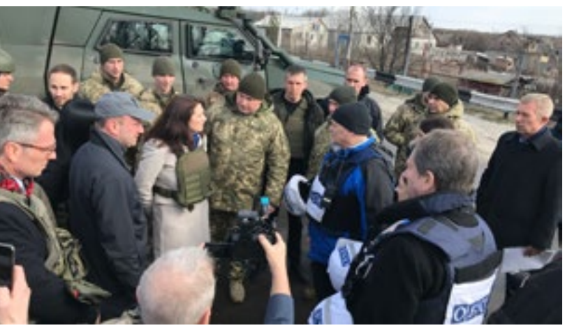
Foreign Minister Ann Linde as incoming CiO near the bridge over the contact line at Stanytsia Luhanska in eastern Ukraine, 3 March 2020.