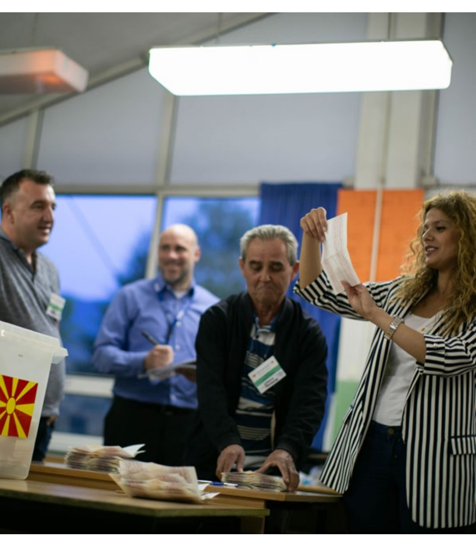
Election observers during North Macedonian presidential election, Skopje, 5 May 2019.