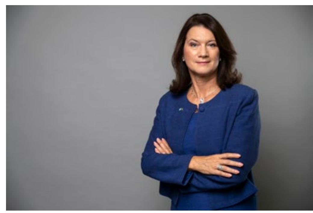
Chairperson-in-Office, Minister for Foreign Affairs, Ann Linde.

The common denominator of all these challenges is this: they can only be solved sustainably through international cooperation. A multilateral platform such as the OSCE, is therefore immensely important. It is time for us to go "back to basics" and remind ourselves of our common rules and tools that we have created to prevent and solve conflicts and crises, and to build